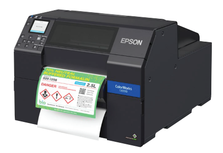
CW-C6500P 8" Peel-and-present