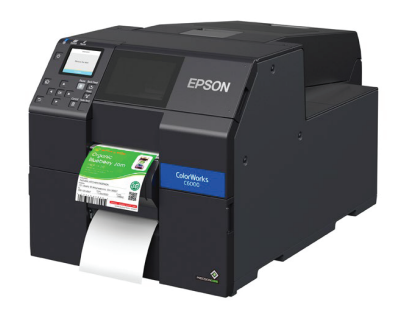
CW-C6000P 4" Peel-and-present

Epson offers the first color inkjet printer with peel-and-present capability, which can help speed up the manual application of on-demand labels. An integrated label-taking sensor holds off subsequent printing until the previous label is removed. This feature is ideally suited for fully automated label application systems. This unique capability eliminates the need for a loose loop and allows individual labels to be taken as soon as they are printed.