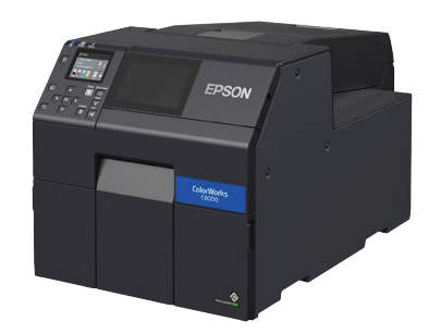
CW-C6000A 4" Auto Cutter

With a 4" or 8" built-in auto cutter covering the full spectrum of label sizes to create variable-length labels and enable easy job separation, these new ColorWorks models offer cost and inventory reductions compared to using pre-printed labels.