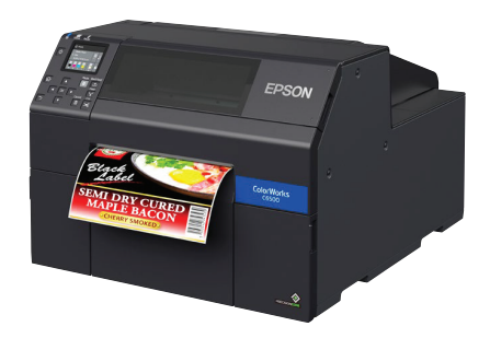
CW-C6500A 8" Auto Cutter